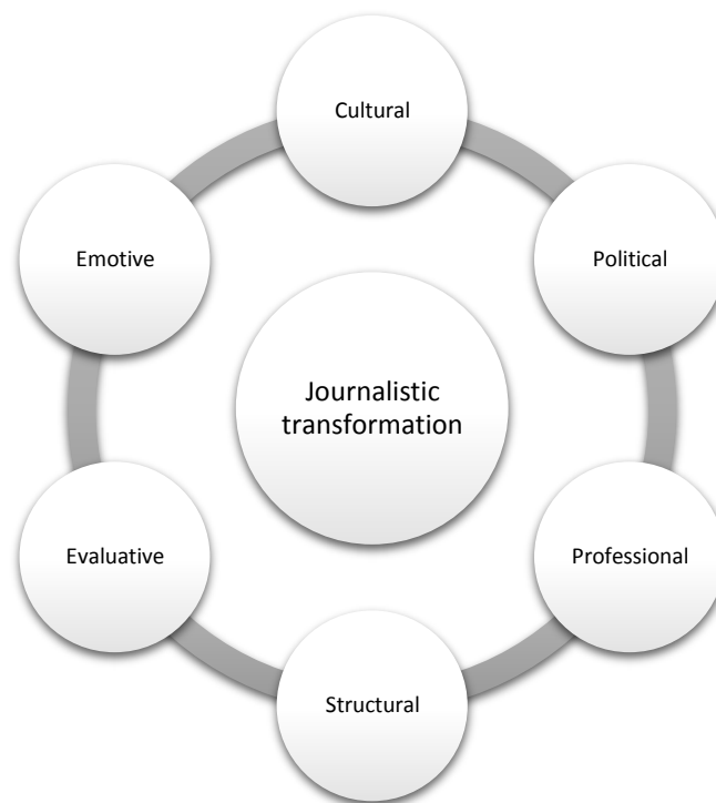
Figure 2: Types of intertextual journalistic transformation

It is also useful to distinguish between different types of intertextual transformations, based on their different functions. Based on a qualitative pilot study, we have distinguished and validated six types of intertextual transformation – cultural, political-ideological, professional, structural, evaluative, and emotive (see Figure 2) – which address central constraints and functions defining journalistic practice. While each kind of transformation relates to rich research traditions in journalism, they have normally been addressed as objectives or outcomes of journalistic news production, disregarding the underlying transformative practices. Appraising journalism's contribution through the prism of journalistic transformations allows us to focus on the multifaceted, unique roles played by journalism within the complex, highly interactive process of conflict discourse. Following is a description of each of these six categories and their particular relevance for conflict coverage.